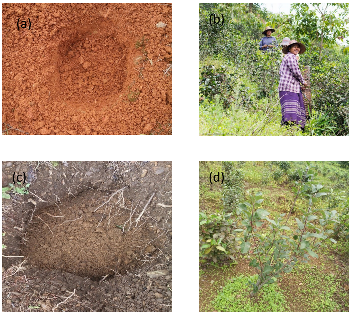
Figure 2. Soil morphology of the locations 1 (a, b) - tea site and 2 (c, d) - apple site.

30 min. Afterwards, the solution was placed for overnight and then analyzed on an Atomic Absorption Spectrophotometer. The standard solution was prepared in an acid mixture similar to that of the sample solution. The wavelengths were set up at 422 nm, 228 nm, 257 nm, 766 nm, 283 nm, 213 nm, 248 nm, and 279 nm, corresponding for individual elements.